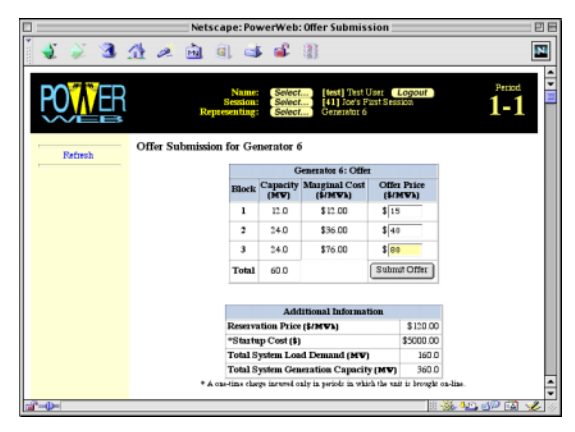
Figure 1: Offer Submission Page

After logging in as a generator in a simple auction session, for instance, the user is taken to the Offer Submission page such as shown in Figure 1, which displays the cost and capacity information for their generator. Here they can enter offers to sell power to the ISO.